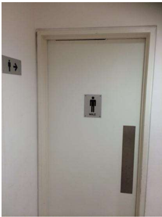
These are the boys' toilets.