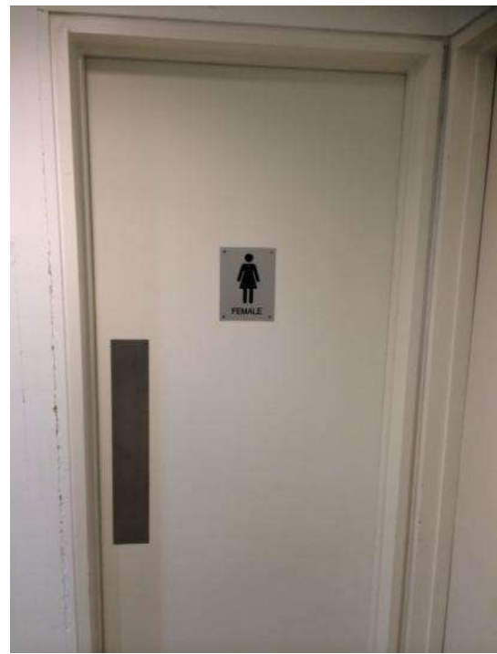
These are the girls' toilets.